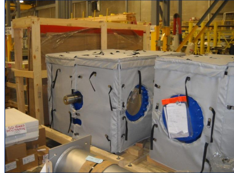
Treated Compressor Ready for Shipment