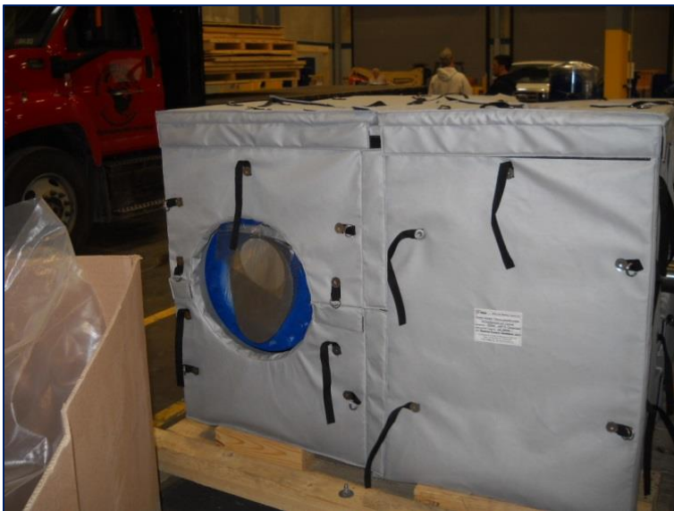
HUSH COVER™ Model HC-500S-2 Compressor Enclosure