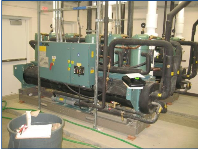
Untreated Scroll Chillers