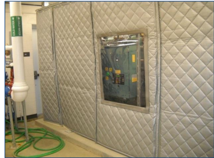
HUSH FLEX™ Finished Enclosure View Window