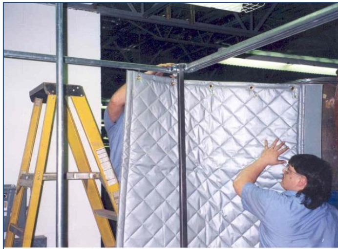
Model ABAC-111N Panels with Grommets for Hanging