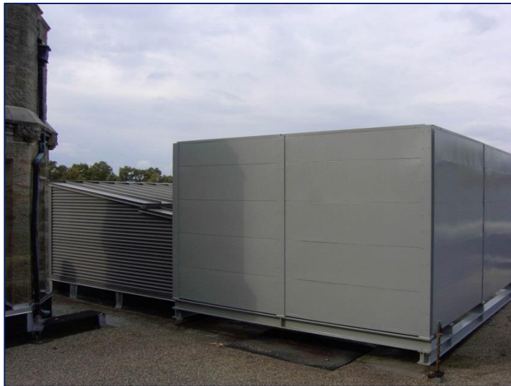
Finished Supreme™ System with HUSH GUARD™ HG-400 Powder Coat Painted Panels