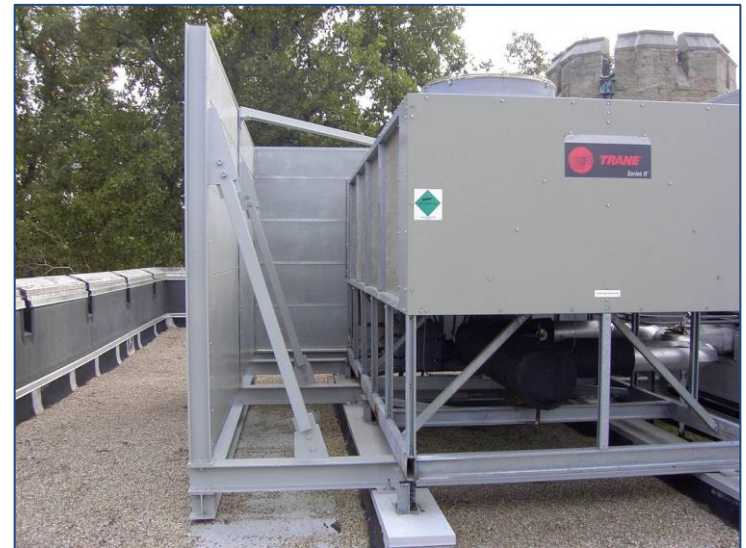
Inside View from Open End of Supreme™ System Enclosure