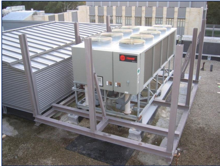
"Floated" Structural Steel Installed (No Roof Penetration)