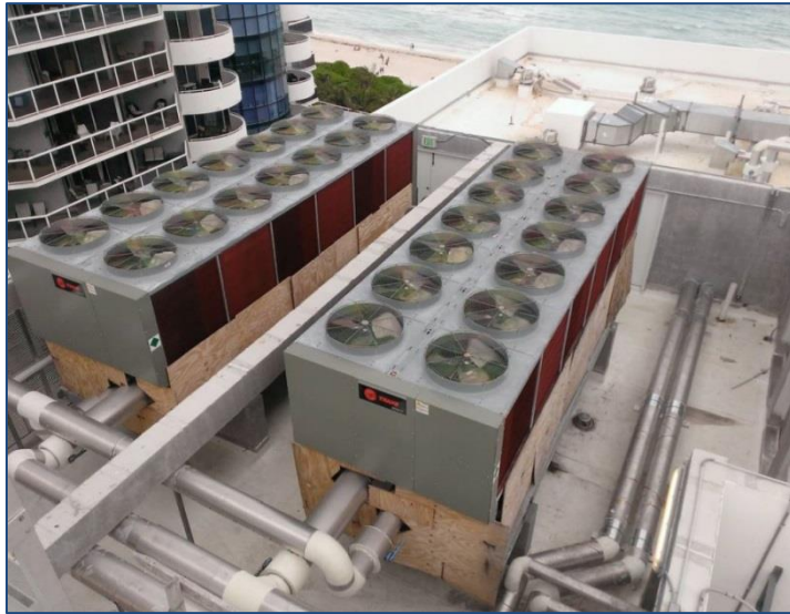
Untreated Air-Cooled Screw Chillers