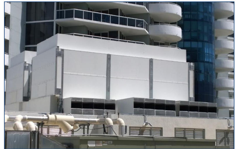
Completed Ultimate™ System Enclosure with Residential Condominium Building in Background